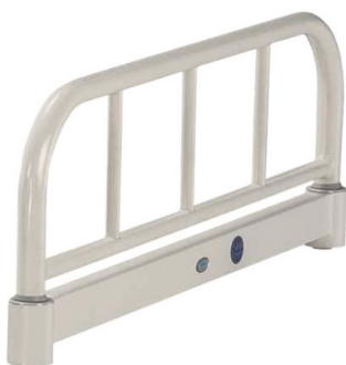
Conventional Head & Foot Board (0181) (pair)