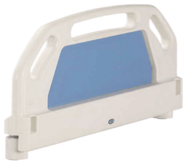
Polymer Moulded Head & Foot Board (0183) (pair)

Compatible with: CX4000A, CX4000B, CX4000C, BX Series