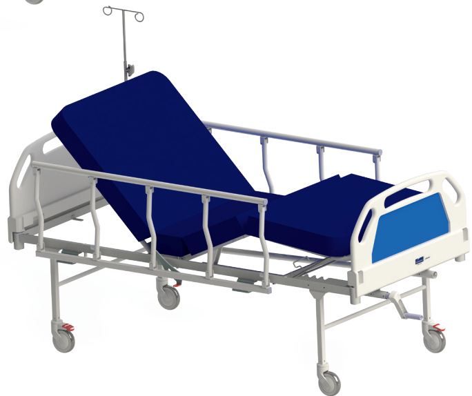
Fowler (Back and Knee / Leg adjustable) bed with polymer moulded head and foot boards, and side railing