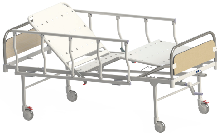
Fowler (Back and Knee / Leg adjustable) bed with stainless steel laminated head and foot boards and side railing