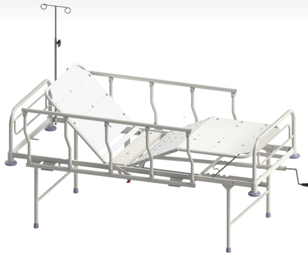
Fowler (Back and Knee / Leg adjustable) bed with conventional head and foot boards and side railing