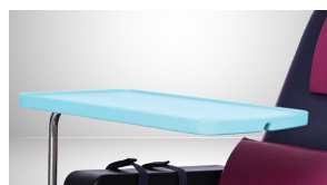
Food Table / Reading Table