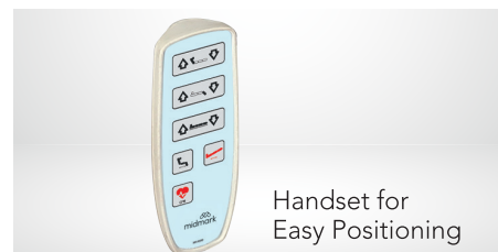
Handset for Easy Positioning