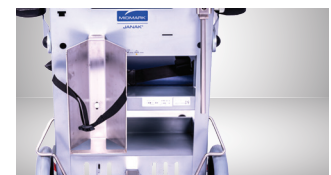
Factory Fitted Urine Bag Holder on the Right Hand Side (RHS)