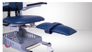
SS Leg Support with Mattress Padding