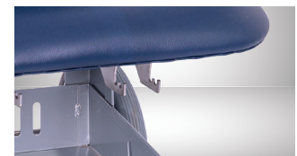
Factory Fitted Urine Bag Holder on the Right Hand Side (RHS)