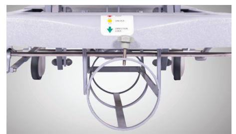
01 Oxygen Cylinder Cage