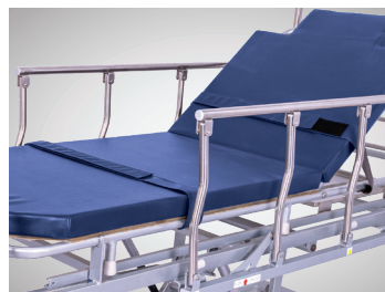
01 Safety Side Railings