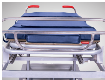
01 Safety Head Board