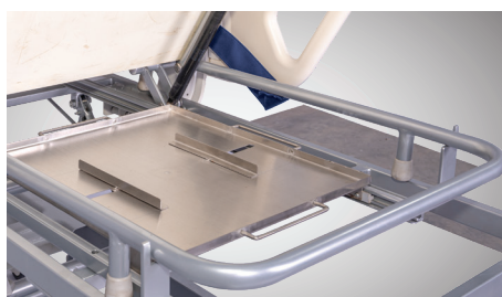
01 X-Ray Permeable platform

AstirO with SS fully collapsible safety side railing (pair)