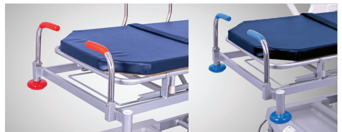
01 Safety corner buffers & push pull handles with rubber grippers (Available in red & blue colours)