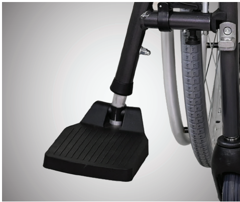
04 Swingable Footrests