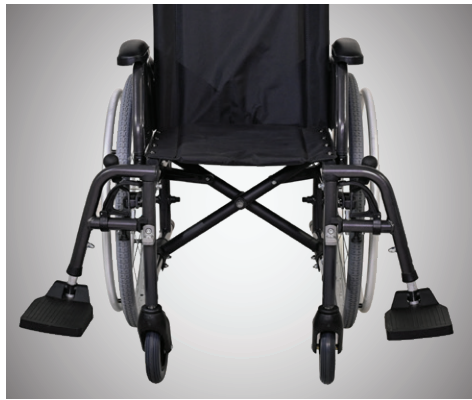
05 Extendable Footrests