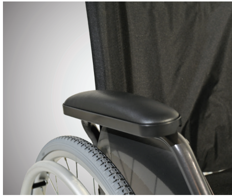
02 Cushioned armrests