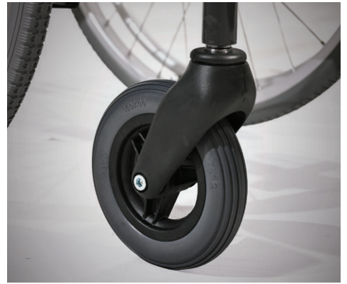
08 Front wheel