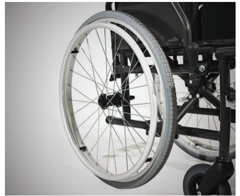
06 Rear wheel