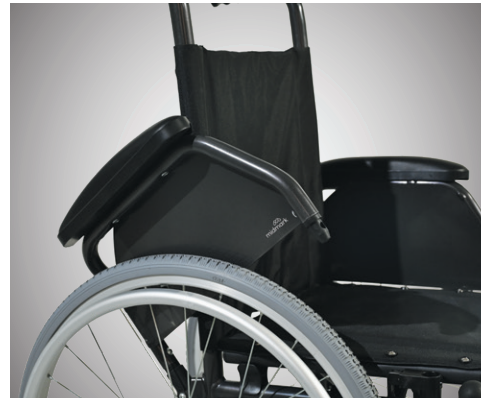
03 Swingable armrests