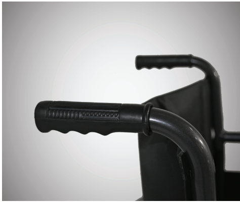
01 Ergonomic handgrips