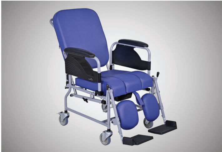
01 Anatomically Reclinable Cushioned Back