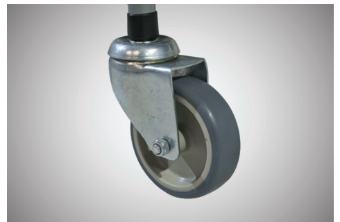
07 100 mm rear wheels