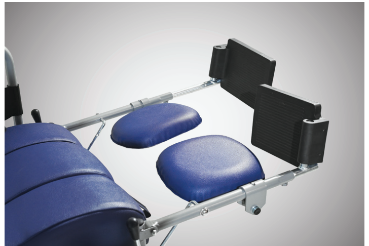
04 Footrest support