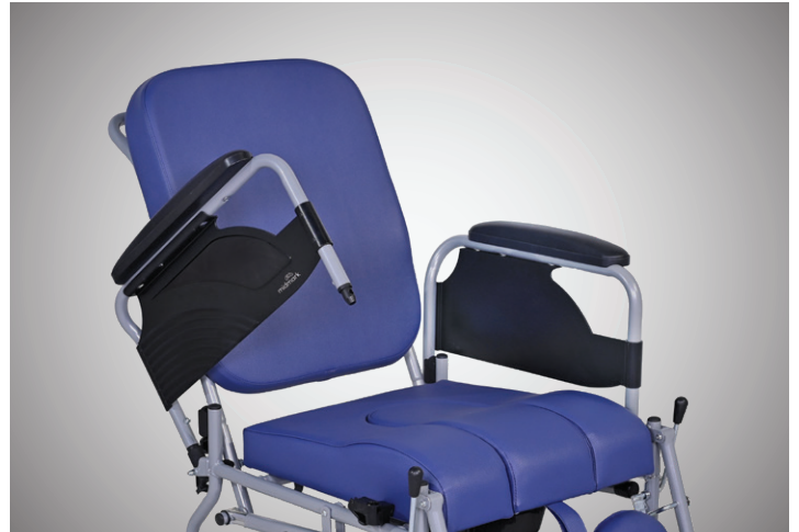
02 Swingable Armrests