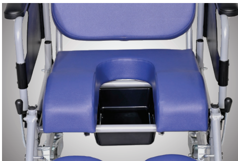
05 U cut with PVC tray