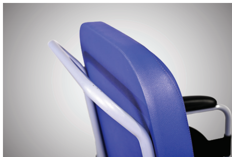
06 Push Handles