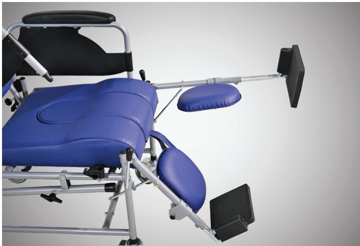
03 Swingable Cushioned Leg Rest