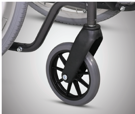
05 Front Wheel