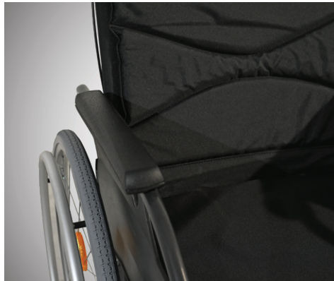
02 Fire retardant nylon material