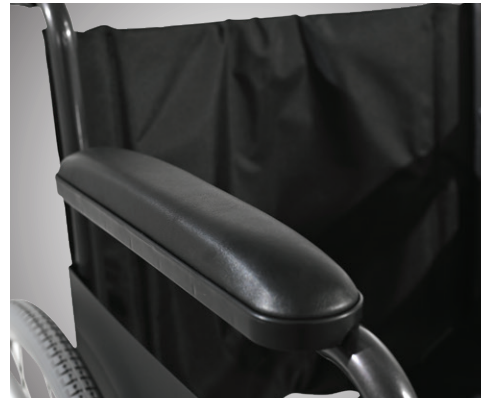
03 Soft arm rests