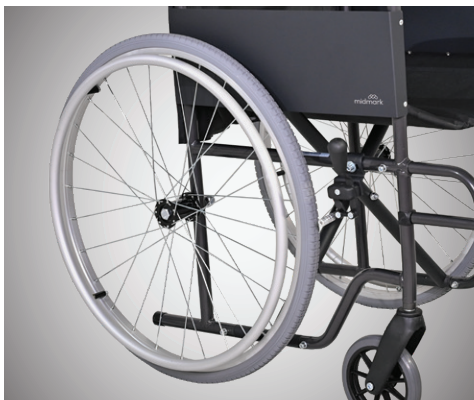
04 Polyurethane tubeless tires with SS spokes