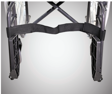
07 Premium footplates with nylon heel strap