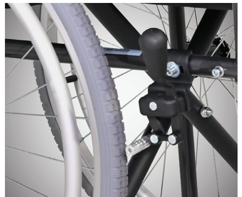
06 High quality brake system in aluminum