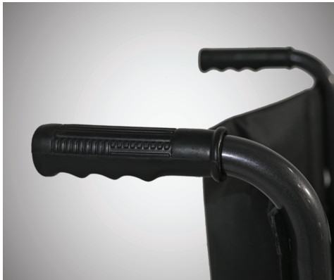
01 Ergonomic handgrips