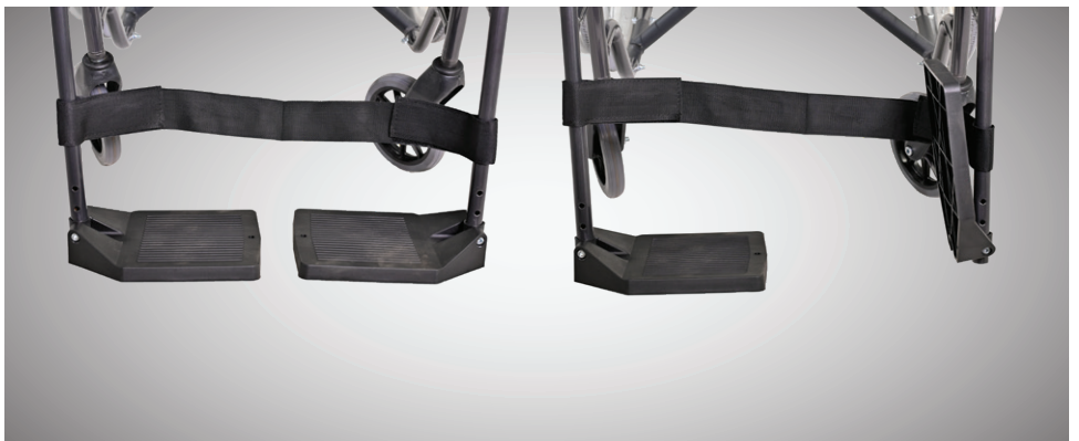
08 Swingable Footplates