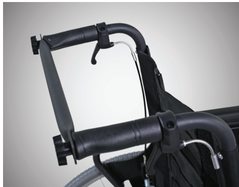
08 Metal push bar