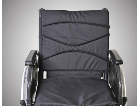
02 Padded nylon seat and backrest