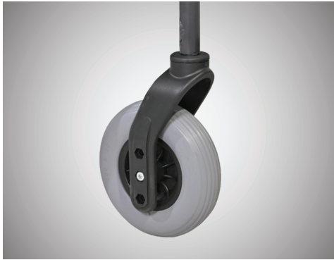
07 Front wheel