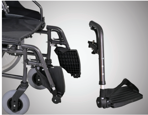
05 In and outwards swingable and detachable leg rest