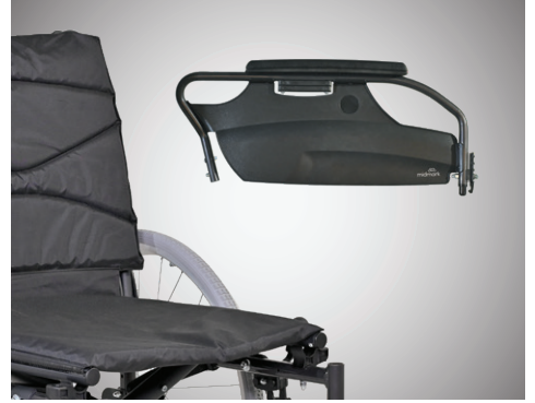
03 Swing-away and detachable armrests