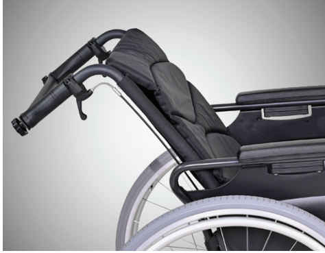
01 30° backrest inclination