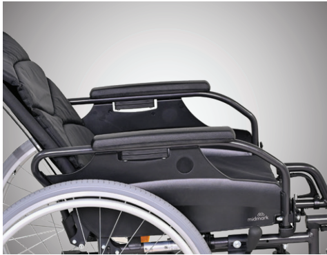
04 In height and depth adjustable arm pad