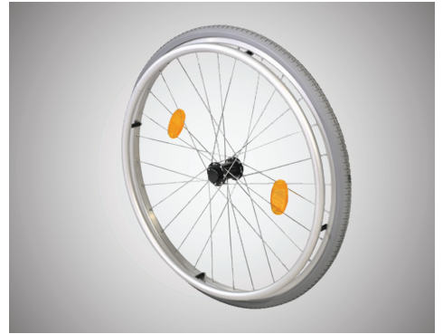
09 Integrated lowering of the rear axle