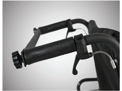
06 Push Handles