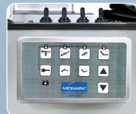
Auxiliary Control on Column