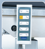
User Friendly Handset