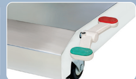
Twin Disk Castors with Central Locking Lever 2 Swivelling and 2 Fixed

Surgical procedures has become customizable with optimized workflow, improved efficacies yet cost-effective measures resulting in maximized profitability. Surgistar Electric Operating Table systems are unmatched in versatility, with detachable and interchangeable head and Leg sections for various surgical procedure, including radio translucent table top that offers outstanding C-arm imaging/ fluoroscopy. Surgistar tables can be adapted to the desired operating environment and are capable of communicating with C-Arm systems to provide the ultimate in imaging and surgical performance. With unmatched adaptive positioning options, Surgistar facilitates seamless patient positioning and improves ergonomics for the surgical team.