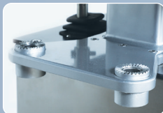
Provision for Ortho Attachment

SURGISTAR MULTI PURPOSE ELECTRO-MECHANICAL OPERATING TABLE