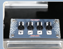
Manual Override System Control