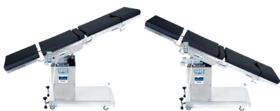
Trendelenburg / Reverse Trendelenburg

Surgistar provides state-of-the-art solutions for cutting-edge, configurable surgical table systems. Surgistar multifunctional OT Tables enable flexible OR function for both minimally invasive and open surgical procedures.