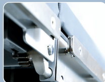
Railings with Locking System for Safety