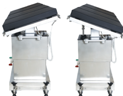
Lateral Tilt (Left / Right)