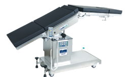
Lateral Thorax Position for Kidney and Thoracic Surgery