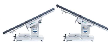
Trendelenburg / Reverse Trendelenburg