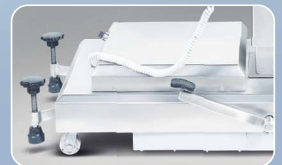
4 Heavy Duty Nylon Castors with Self-levelling Vacuum Assisted Manual Locking & Pump for Manual Override

Surgical procedures has become customizable with optimized workflow, improved efficacies yet cost-effective measures resulting in maximized profitability. Surgistar+ Electrohydraulic Operating Table systems are unmatched in versatility, with detachable and interchangeable head and leg sections for various surgical procedure, including radio translucent table top that offers outstanding C-arm imaging/fluoroscopy. Surgistar+ tables can be adapted to the desired operating environment and are capable of communicating with C-Arm systems to provide the ultimate in imaging and surgical performance. With unmatched adaptive positioning options, Surgistar+ facilitates seamless patient positioning and improves ergonomics for the surgical team.