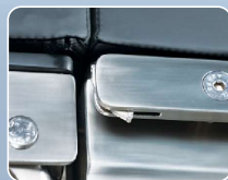
Railings with Locking System for Safety