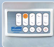
Auxiliary Control on Column