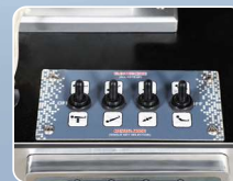
Manual Override System Control