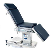
Back section Adjustment