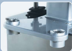
Provision for Ortho Attachment

SURGISTAR + MULTI PURPOSE ELECTROHYDRAULIC OPERATING TABLE