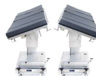
Lateral Tilt (Left / Right)