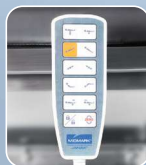
User Friendly Handset