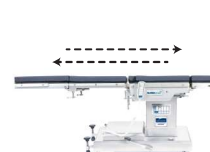
Longitudinal Slide Towards Leg Side