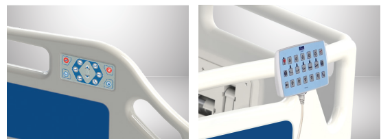
Embedded panel with lock button