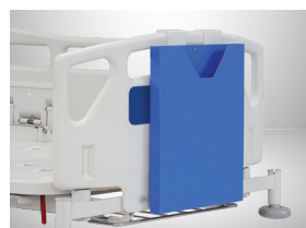
Moulded Chart Holder