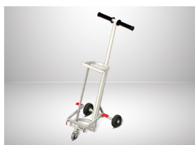
Oxygen Cylinder Cage