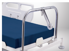
Orthopaedic Traction Pulley