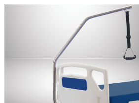
Stainless Steel Lifting Pole