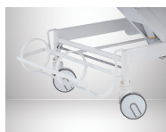
O2 Cylinder Cage