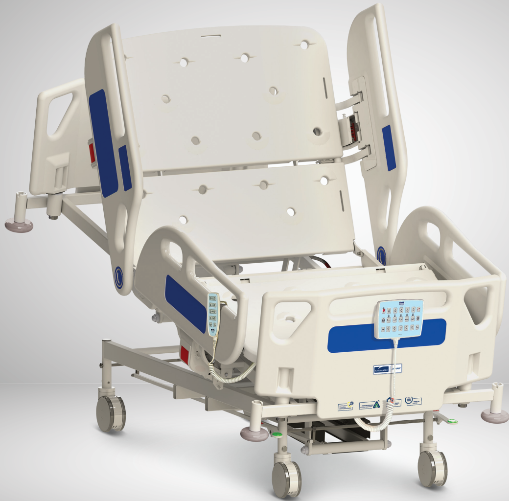
EX6000 Plus with full length coverage

A bed with state-of-the-art technology and an attractive appearance, EX6000 Plus offers quality beyond comparison, blended with wide range of features such as patient comfort, caregiver convenience, ease of mobility and is engineered to international standards. This new bed from Midmark India stands out with effortlessness and elegance, with charm and caliber.