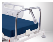
Orthopaedic Traction Pulley