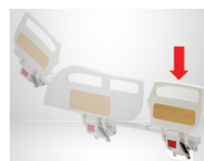
3rd Set of Safety Side Railings