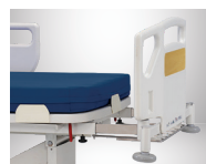
Bed Extension †