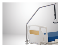
Stainless Steel Lifting Pole