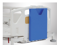
Moulded Chart Holder