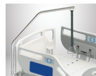
Heavy Duty SS Lifting Pole