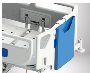
Modular Chart Holder