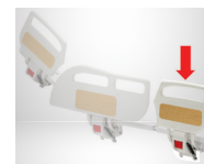
3rd Set of Safety Side Railings