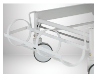
O2 Cylinder Cage