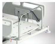
Orthopedic Traction Pulley